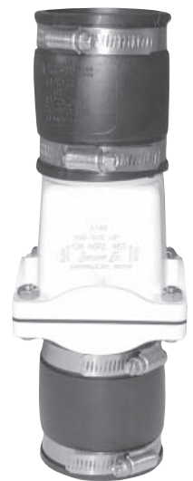
30-0021 PVC PLASTIC