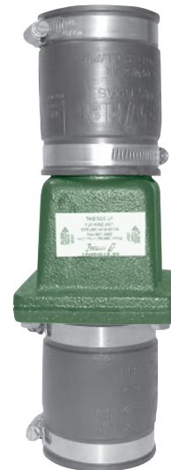
30-0151 CAST IRON